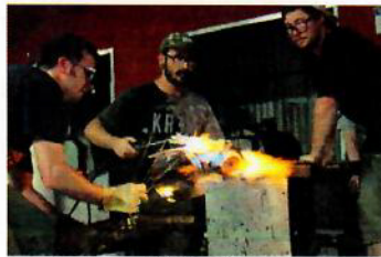
Hot Glass demo at STARworks

STARworks is located seven miles south of Seagrove at 100 Russell Drive in Star. For more information, visit ( www.STARworksNC.org ) or call 910/428-9001. Rhonda McCanless works full-time for Central Park NC and STARworks in Star and can sometimes be