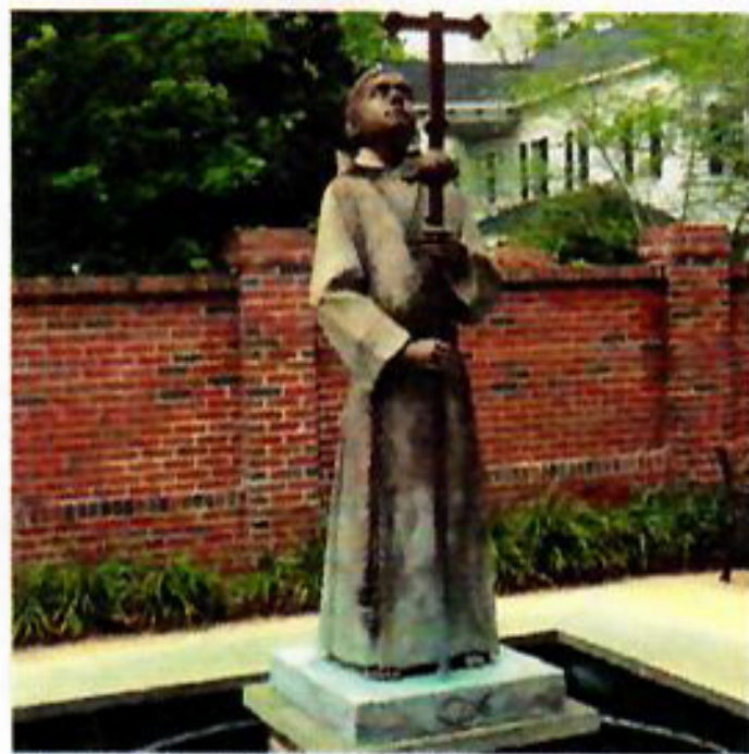
"Acolyte" by Bob Barinowski

Carolina Bronze Sculpture also offers molding services, lost wax and sand cast bronze and aluminum casting and digitally integrated metal and composite fabrication services for artists. They can provide