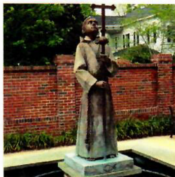
"Acolyte" by Bob Barinowski

consist of portraiture, figurative and relief sculpture in terra cotta and hot and cold cast bronze.